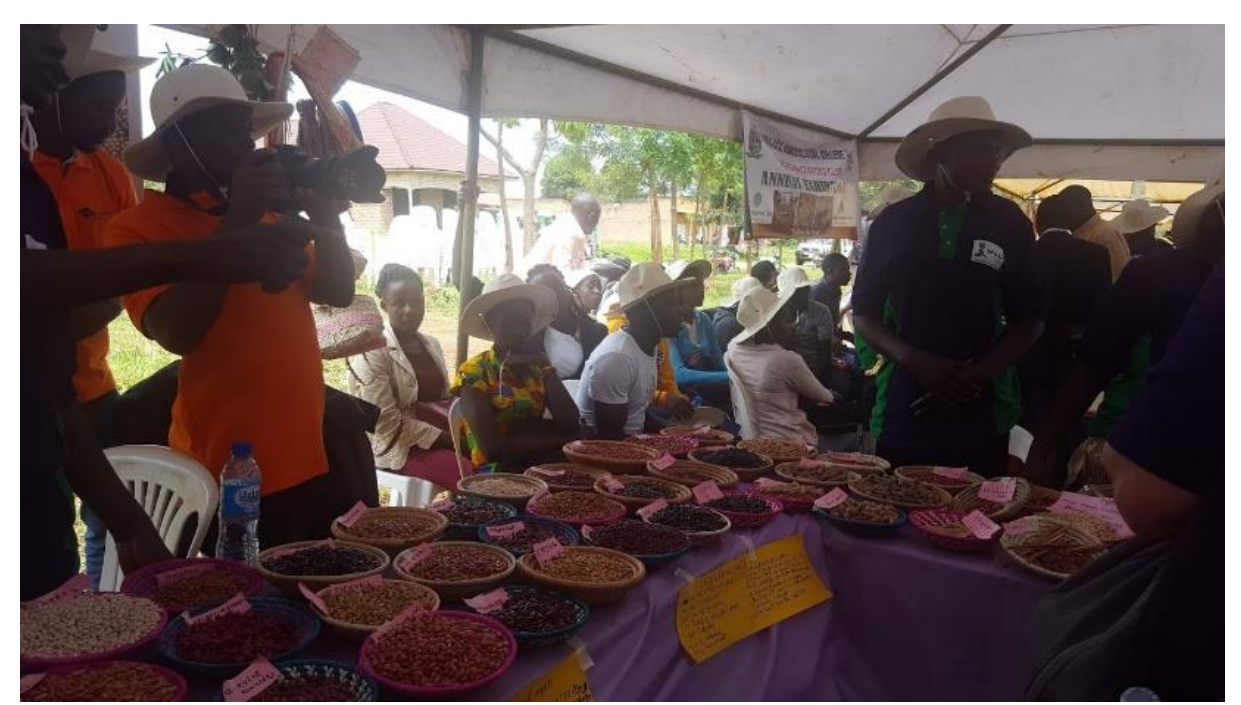
Nakasongola, Uganda. Seed exposition at diversity fair (October 2019)

2. Research previous socio-economic studies. This allows the possibly to gather more data, for example, from already available consumer statistics, which would allow one to have a more representative sample. However, in this case, information may be less tailored to the needs of the intended market segmentation.